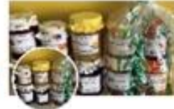
Not That's Not Good, Jam, Marmalades and Pickles

Raffle Tombola Knitted/ Crocheted Gifts Pocket Money Toys BodyShop Jewellery Wreaths Wax Melts Bows Personalised Gifts Cupcakes Jams